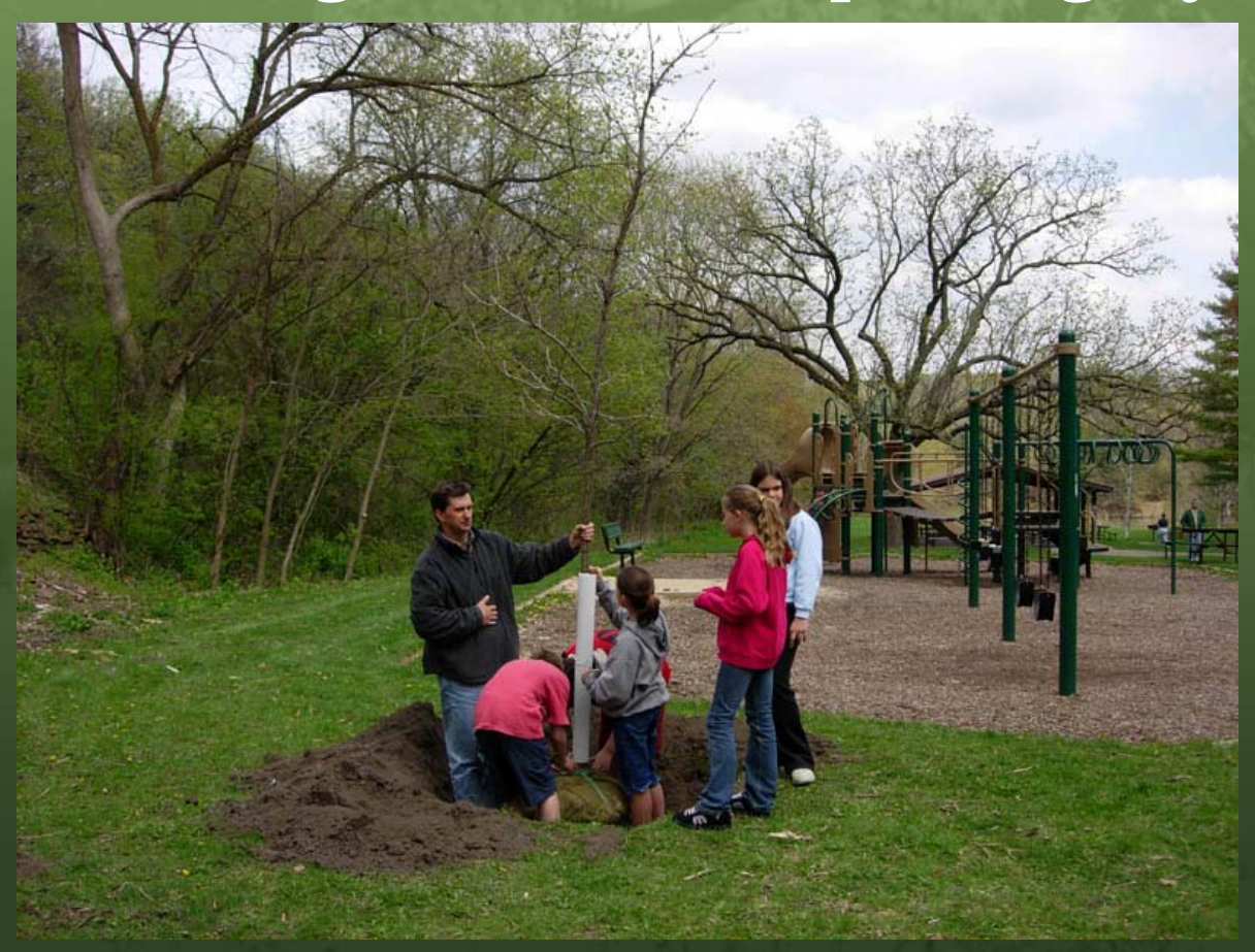
Arbor Day 2005 Dane County Stewart Park, Mt. Horeb

Plant Trees. Start a Legacy. Manage Trees. Keep a Legacy.